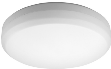
LAUNDRY/ WIC/ STORAGE: Ceiling Light Fixture