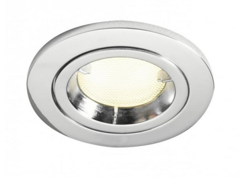
NICHE LIGHT: Low voltage ceiling niche light

* All light fixture locations shown on plans (including recessed) may vary due to structural or code issues.