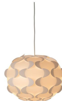
DINING/HALLS: Pendant Light Above the Table

* All light fixture locations shown on plans (including recessed) may vary due to structural or code issues.