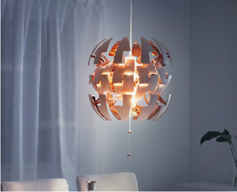
DINING/HALLS: White and copper design pendant