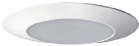
BATHROOM: Recessed Light