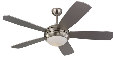
BEDROOM/GREAT ROOM: Brushed steel five bladed 52" ceiling fan