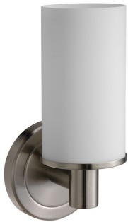
BATHROOM/CORRIDOR: Wall sconce