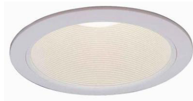
KITCHEN: Recessed Light (Possible placement in other areas- per plan)