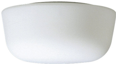
BEDROOM: Ceiling Light Fixture